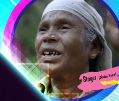
Singer (Nadan Pattu)